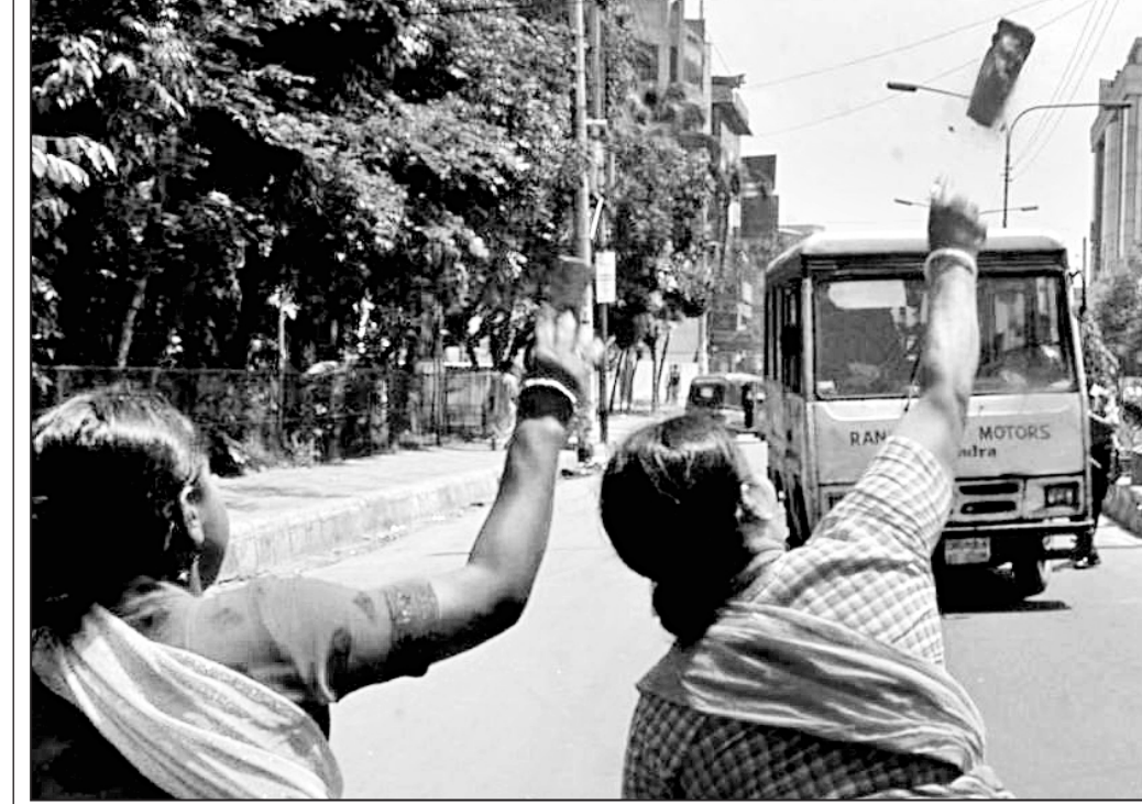
Two female Awami League activists throw brickbats at a bus during hartal hours at Dhanmondi in the city yesterday.