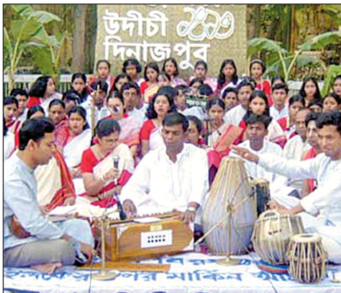
Artists of Udichi Dinajpur performing at the programme