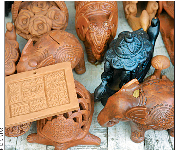
Handicrafts made of clay on display at a roadside stall

Then there are the vases and jugs painted with traditional flowers and leaves as well as geometrical motifs of circles, lines, dots and whirling swirls of beige, brown and