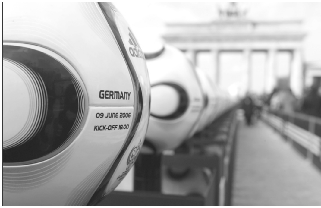
The football that will be used for the opening match of the 2006 Football World Cup is displayed during an unveiling ceremony in front of the Brandenburg Gate in Berlin on Tuesday. Hosts Germany play Costa Rica in the match in Munich on June 9.