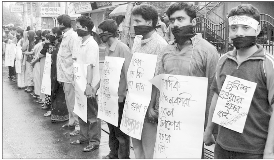
Human chains formed by Shahjalal University Photo Journalists Association in Sylhet (left) and by different organisations in Chittagong yesterday protesting Sunday's police action on journalists.