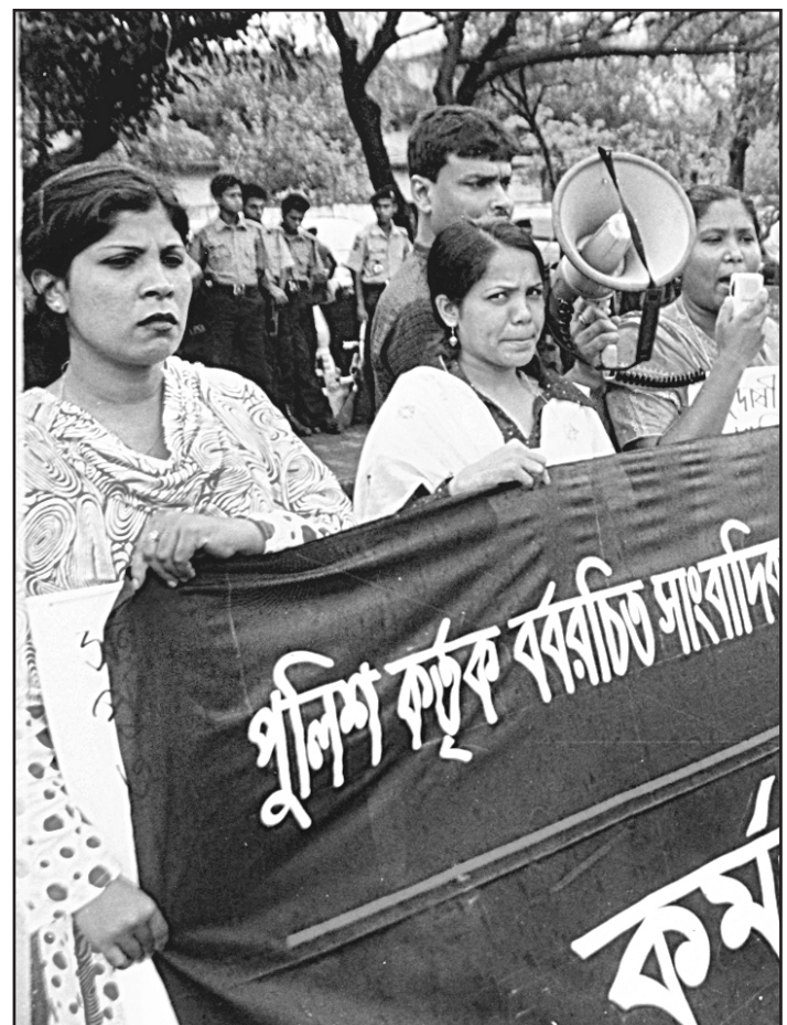
Karmajibi Nari forms a human chain at Muktangan in the city yesterday protesting police assault on journalists in Chittagong.