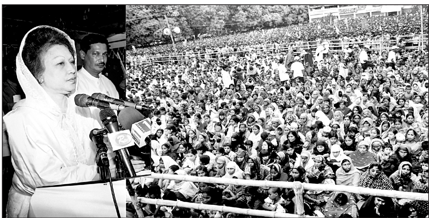
Prime Minister Khaleda Zia addresses a huge public meeting on Singra Court premises in Natore yesterday.

However, none was arrested in this connection. The bottles of phensidyl were deposited to Narcotics Control Department and a case was filed.