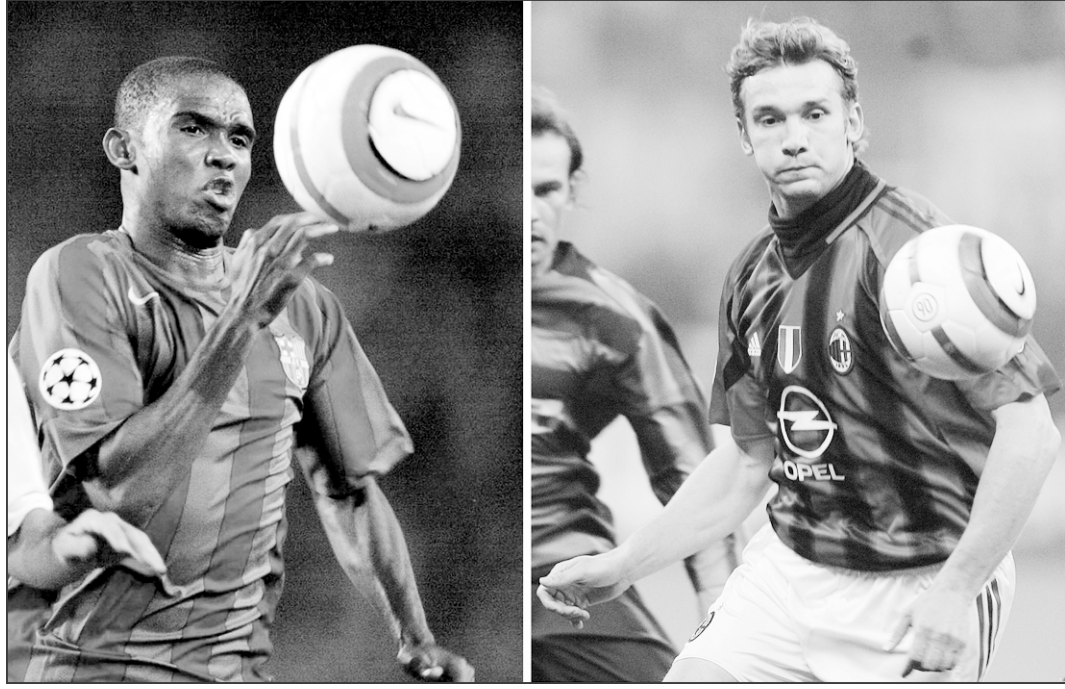
Samuel Eto'o (L) of Barcelona and Andriy Shevchenko of Milan are all geared up for an enticing semifinal clash.