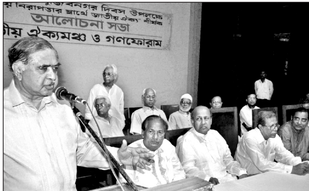
Jatiya Oikya Mancha President Dr Kamal Hossain speaks at a discussion on Mujibnagar Day at the Institution of Engineers in the city yesterday.