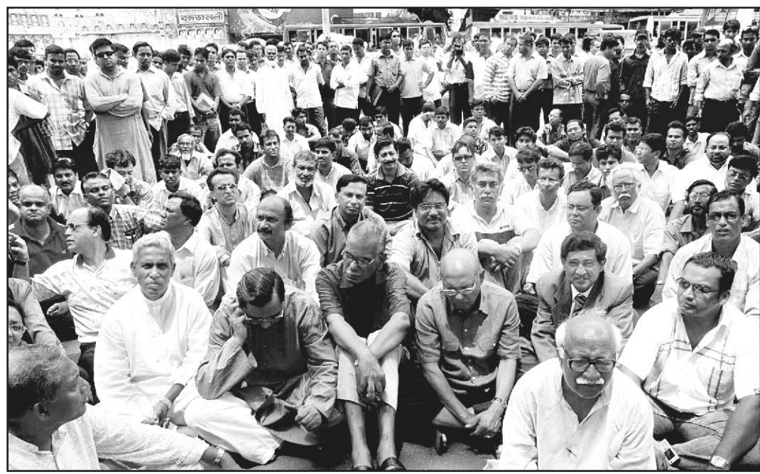
Dhaka Union of Journalists stages a sit-in in front of the National Press Club yesterday in protest against Sunday's police action on photojournalists in Chittagong. Leaders of 14-party opposition combine and former sportsmen joined the demonstration to express their solidarity.