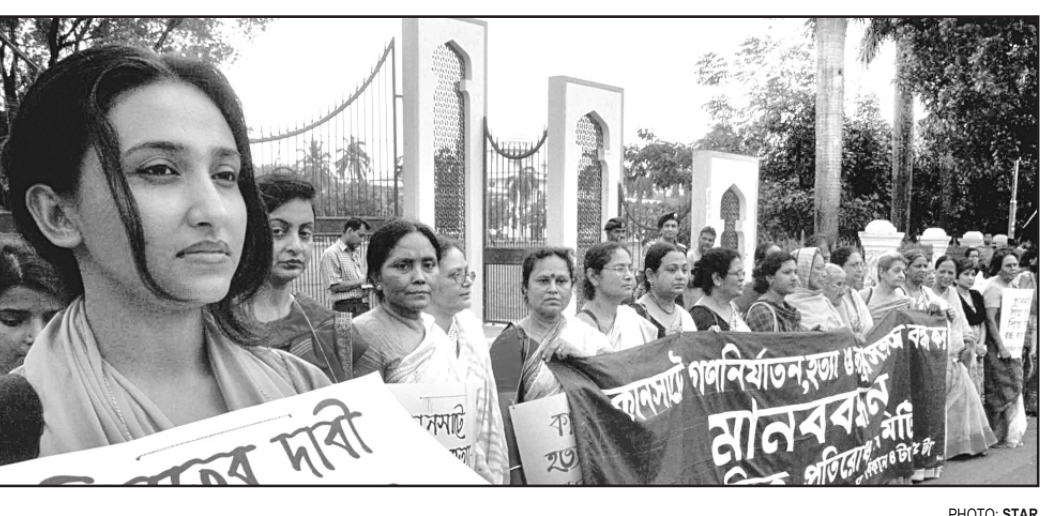
Samajik Protirodh Committee stages a demonstration in front of the High Court in the city yesterday protesting the killings at Kansat in Chapainawabganj.

have thereby introduced the worldteachers' training programme