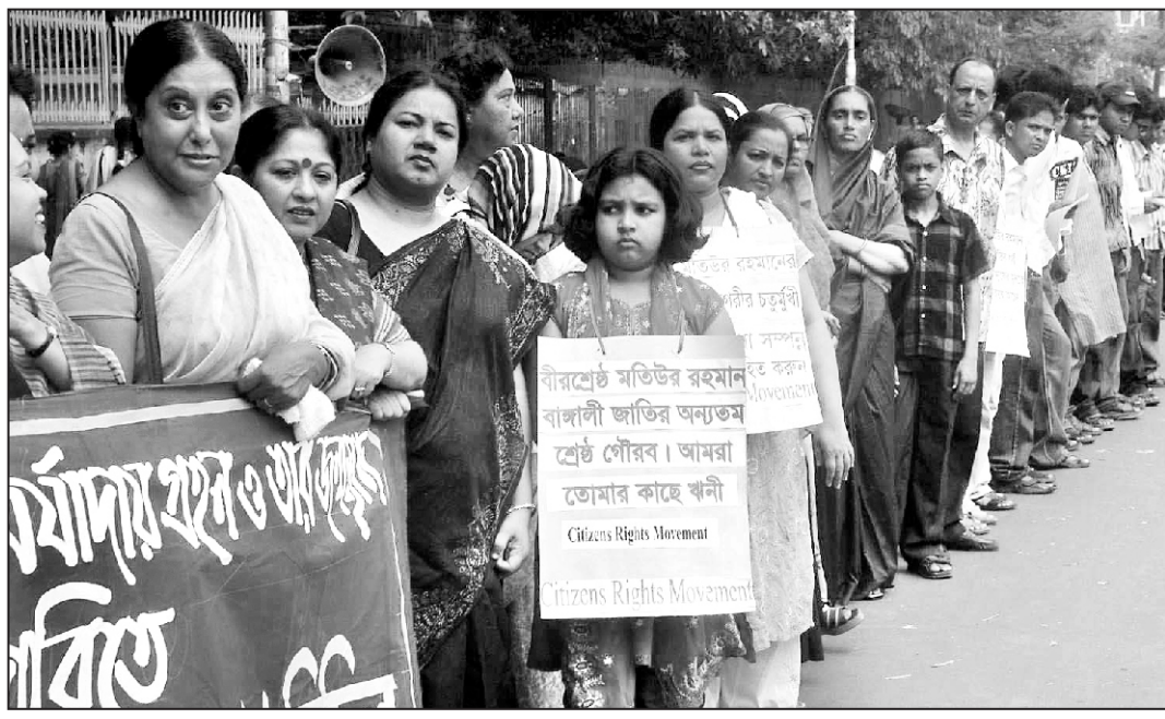
Citizens' Rights Movement forms a human chain at Shahbagh in the city yesterday demanding burial of remains of Bir Shreshtha Matiur Rahman at an open space in the city.

The winners were chosen from 27 nominees, including top-level policy-makers, researchers and health workers from around the world, by a committee consisting of 10 UN member states.