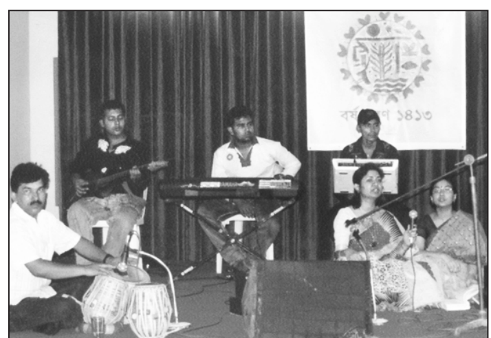
A musical session to welcome Bangla New Year was held at the auditorium of Gazi Bhaban in the city on Friday.

The university authorities will cancel admission if any student remains absent for ten days at a stretch without any valid reason.