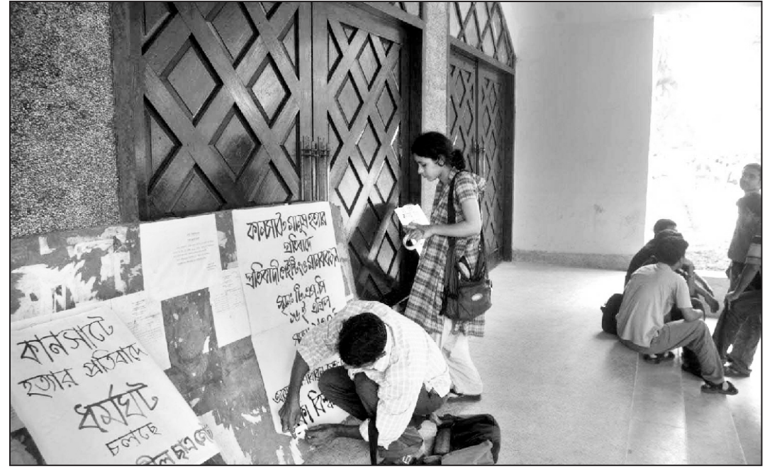
The main gate of Arts Building at Dhaka University remains closed as Bangladesh Chhatra Union observed a strike yesterday to protest the killings of demonstrators at Kansat.

Another truck driver fled the scene soon after the incident.