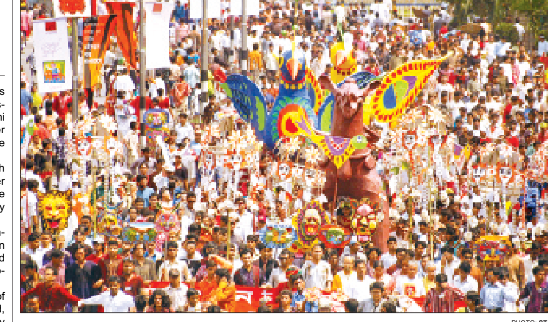
The students of Fine Arts Institute bring out a colourful procession marking the beginning of Bangla year 1413. The SEE PAGE 15 COL 6 photo was taken on the Pahela Baishakh at Shahbagh in the capital.

The leaders and activists of Bangladesh Muktijoddha Sangsad. Nirmul Committee and the 14-party brought out a procession in