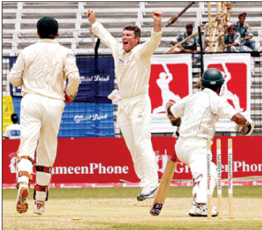
8-UP MACGILL: Australia leg-spinner Stuart MacGill is elated after dismissing Bangladesh wicketkeeper Khaled Mashud on the second day of the first Test on Monday.