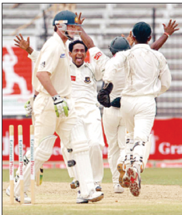
Bangladesh spinner Mohammad Rafique celebrates capturing the wicket of Australia opener Mike Hussey on the second day of the first Test at the Fatullah Cricket Stadium on Monday.

The West Indies won the last edition of the Champions Trophy two years ago defeating hosts England in the final.