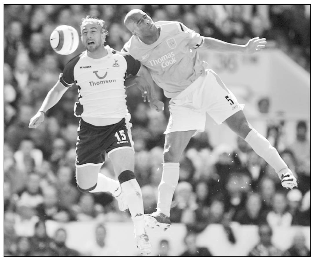
Tottenham Hotspur striker Mido (L) fights for possession with Sylvain Distin of Manchester City during their Premiership match at White Hart Lane on Saturday.

Graeme Smith (captain), Jacques Kallis (vice-captain), AB de Villiers, Herschelle Gibbs, Ashwell Prince, Jacques Rudolph, Mark Boucher, Shaun Pollock, Nicky Boje, Andre Nel, Mahyava Ntini, Boeta Dippenaar, Andrew Hall, Garnett Kruger, Hashim Amla, Dale Steyn.