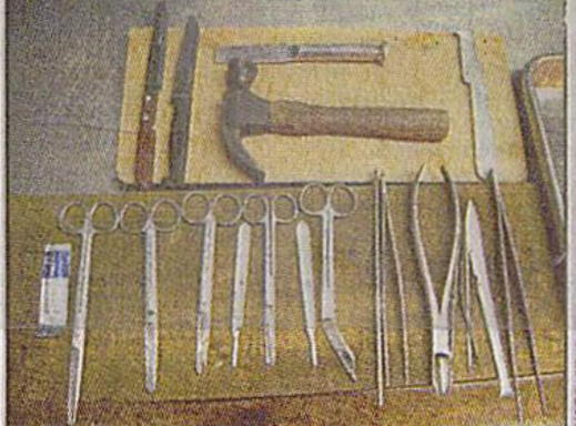
A poorly maintained refrigerator at Dhaka Medical College and Hospital morgue, left, and instruments used for autopsy.