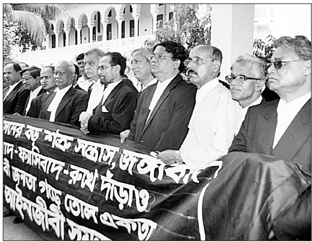
Sammitia Ainjibi Samannay Parishad forms a human chain in front of the High Court in the city yesterday protesting terrorism and militancy.

Stressing the formation of a South Asian parliament to promote dialogues among regional powers, former state minister for foreign affairs Abul Hasan Chowdhury said, "I don't think any major change is possible without dialogue and consultations on the regional issues."