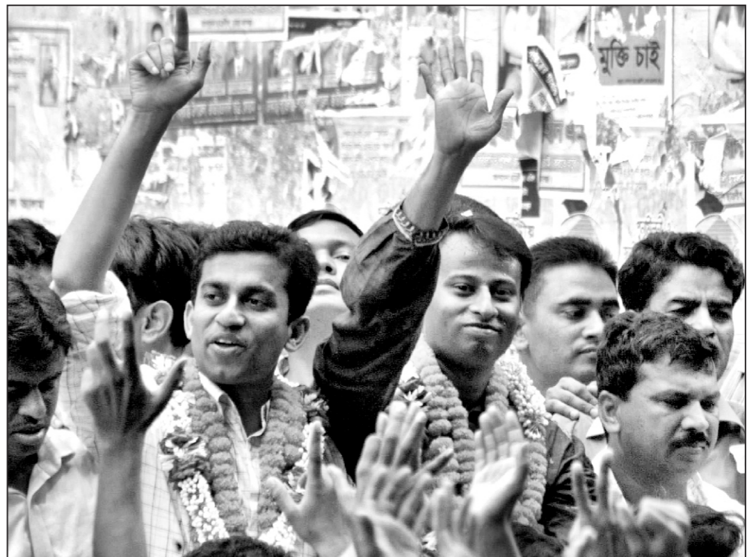
Newly elected president and general secretary of Bangladesh Chhatra League (BCL) wave to students on the Dhaka University campus at a reception yesterday.