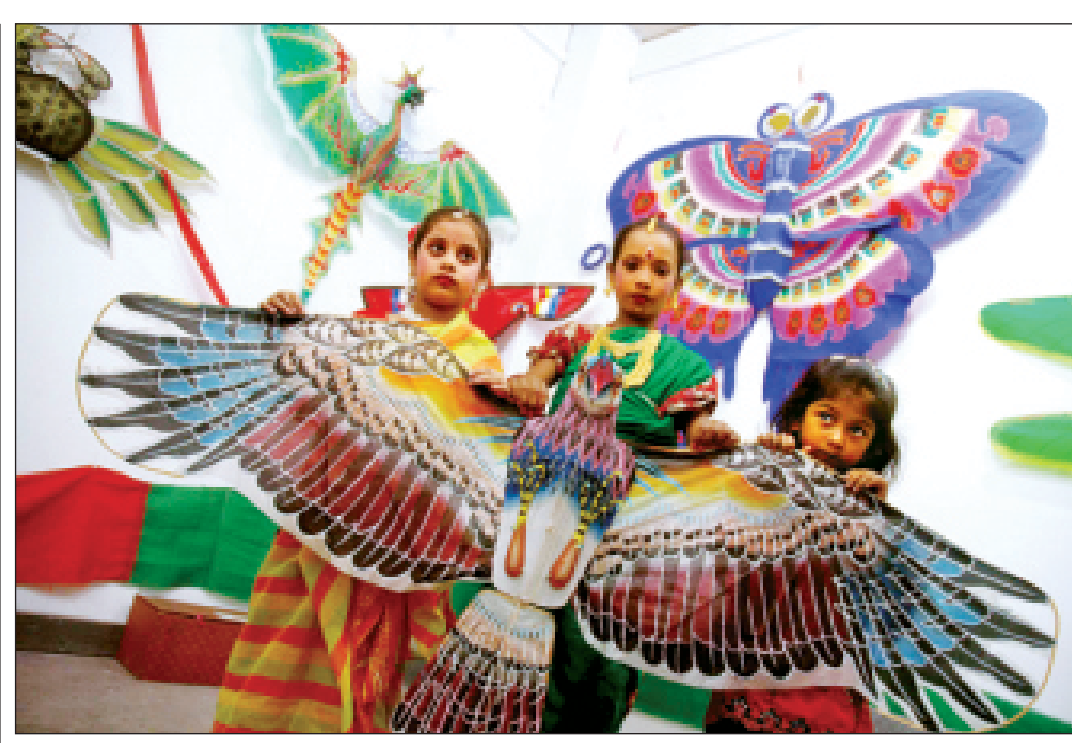
Three children display a colourful kite at an exhibition at the National Museum in the capital yesterday. Dhakabashi an organisation of Dhaka residents, and the Chinese Embassy jointly organised the kite show.