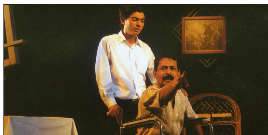
A scene from the play, Bela Shesher Golpo