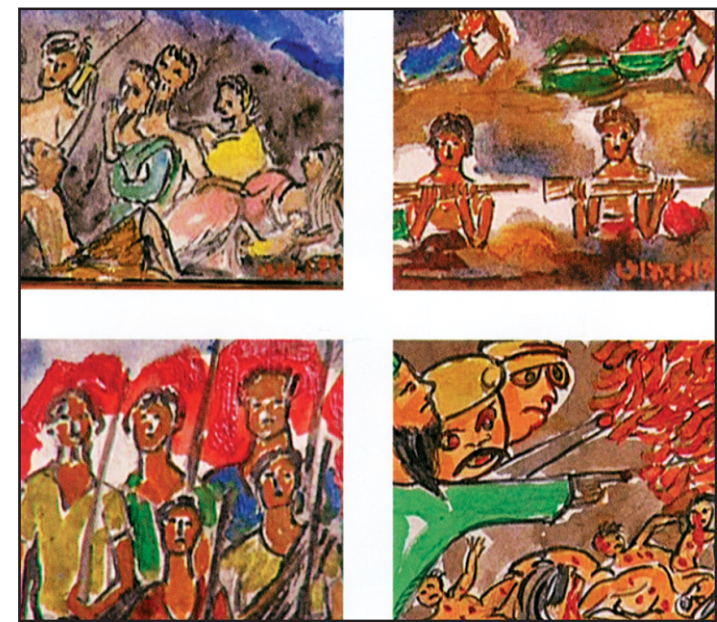
Paintings on display at the exhibition, the artist (Top)

The paintings resemble art done by an amateur, they have a certain raw, childlike approach to them. However, some images are graphic; which indicate the impressions and thoughts of an adult. According to Rasha, he had been working on the paintings for last five years. Two woodcuts by the artist, titled Bastobota and Goribo Bamomala are also on display at the exhibition.