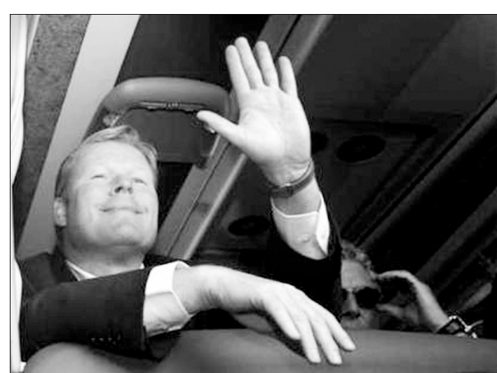
Benfica coach Ronald Koeman waves to supporters upon his arrival at the Barcelona Airport on Tuesday.

"I don't see anyone capable of scoring as many goals at Benfica as him," he told private Portuguese