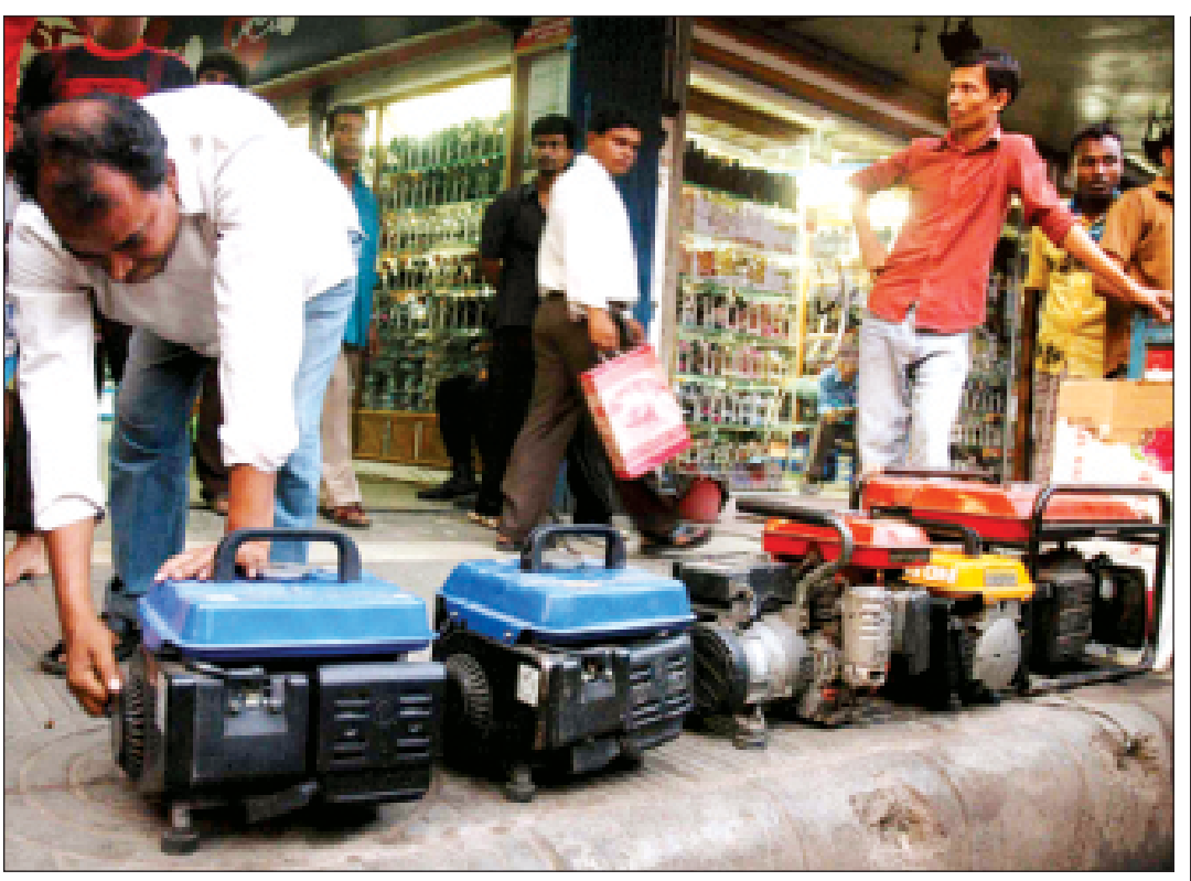
Frequent power blackouts have forced traders in the capital's Elephant Road to use their own diesel-run generators to light their shops and showrooms

Earlier, the PDB authorities predicted that the power supply situation would improve by March 31 as they had expected to be able SEE PAGE 15 COL 6