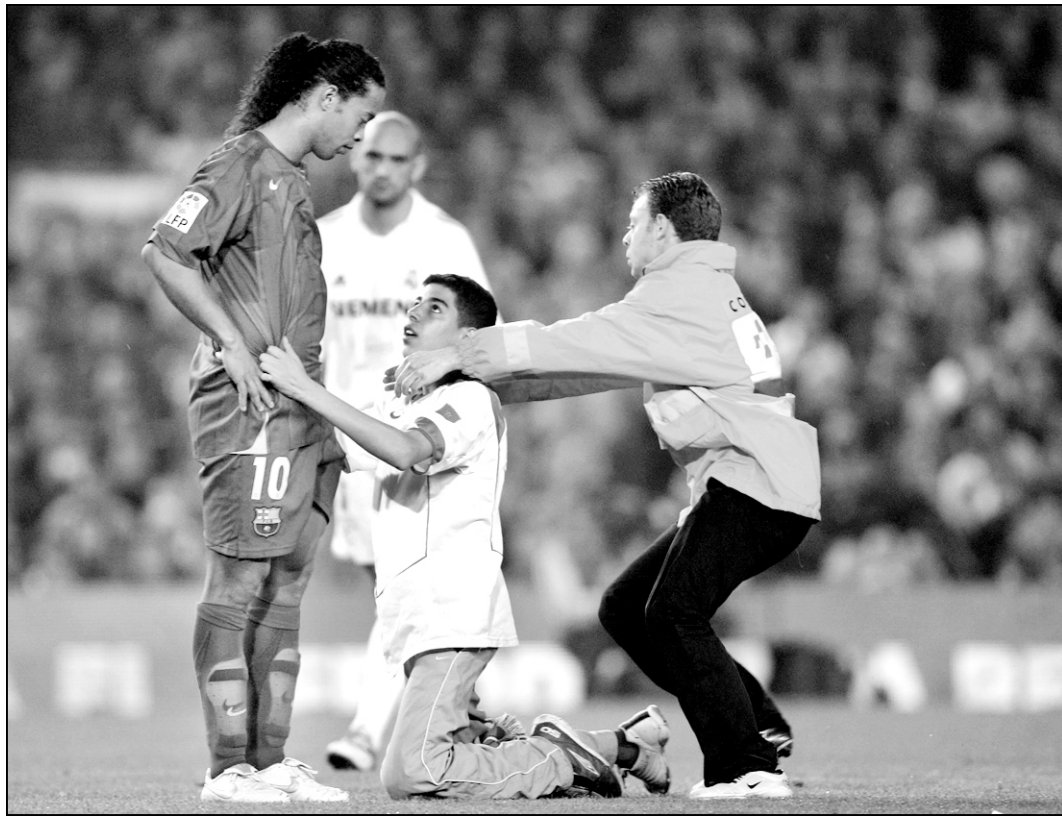
A young Ronaldinho fan, who invaded the pitch, being taken away by a securityman during the Primera Liga clash between Barcelona and Real Madrid at the Nou Camp on Saturday.

Alonso has 28 points to 14 for Fisichella and Raikkonen. Schumacher and Button are level on 11. Renault lead the constructors' standings with 42 to McLaren's 23.