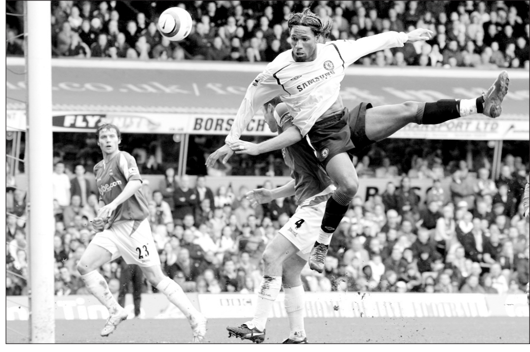
Chelsea striker Didier Drogba (R) is airborne while heading at the Birmingham goal during their Premiership match at St. Andrews on Saturday.

The Sri Lankan team is hoping to give former skipper Sanath Jayasuriya a grand farewell by winning the second and final Test against Pakistan starting here on Monday. Left-handed Jayasuriya, 36, Sri Lanka's highest run-scorer in both Test cricket and one-day internationals, announced his retirement from Tests on Friday.