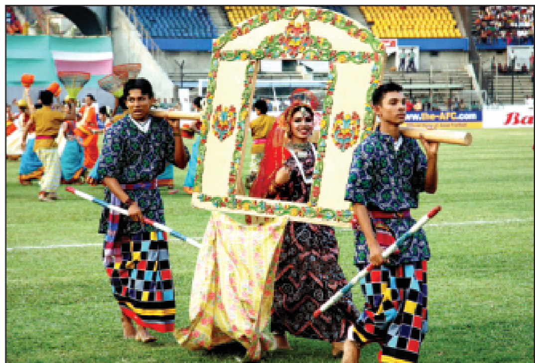
Performers showcasing rituals of rural Bangladesh at the opening ceremony of the AFC Challenge Cup at the Bangabandhu National Stadium on Saturday.