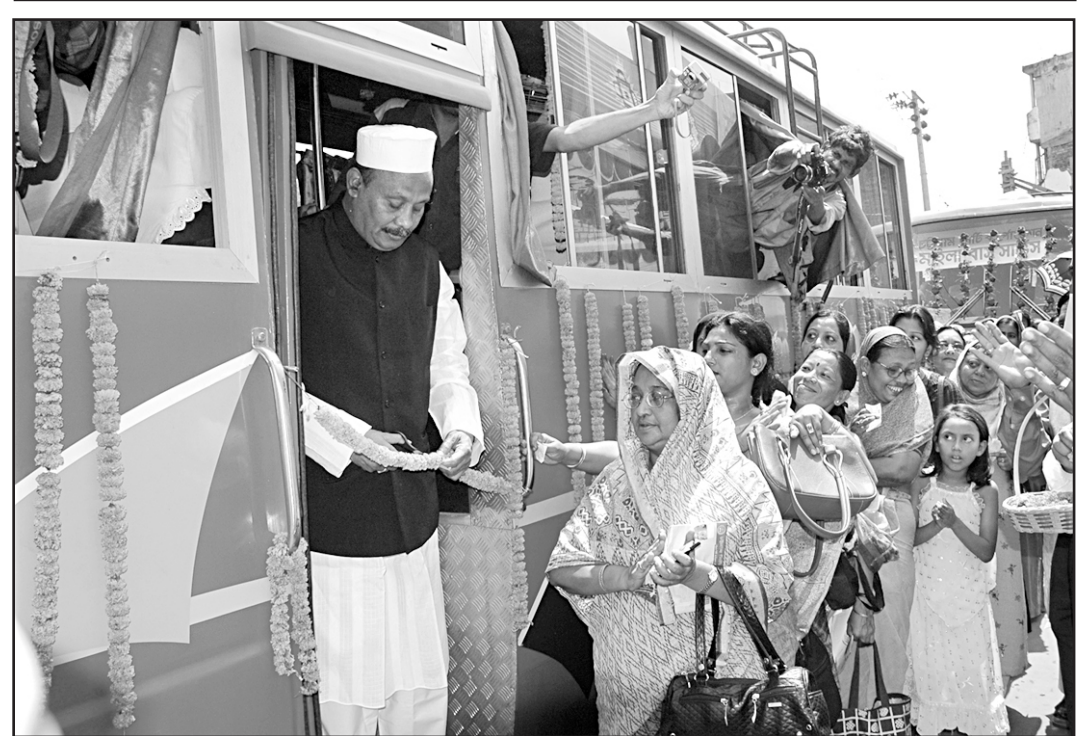
Mayor ABM Mohiuddin Chowdhury formally inaugurates the special city bus service for women at a ceremony at Anderkilla intersection in Chittagong city yesterday.