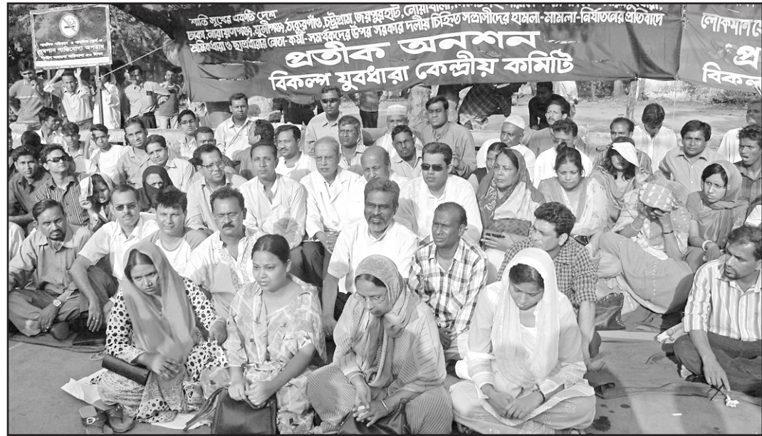
Bikalpa Dhara Bangladesh observes a token hunger strike at Muktangan in the city yesterday protesting false cases and harassment of its leaders and activists.