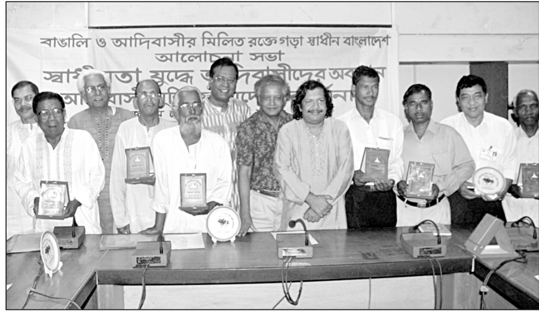
Seven indigenous freedom fighters pose with the guests at a reception ceremony for them at the National Press Club in the city yesterday. Bangladesh Adivasi Odhikar Andolon and Research and Development Collective (RDC) jointly organised the event.