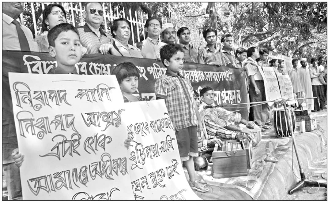
Save the Environment Movement form a human chain in Shahbagh in the city yesterday demanding immediate steps to resolve water crisis.