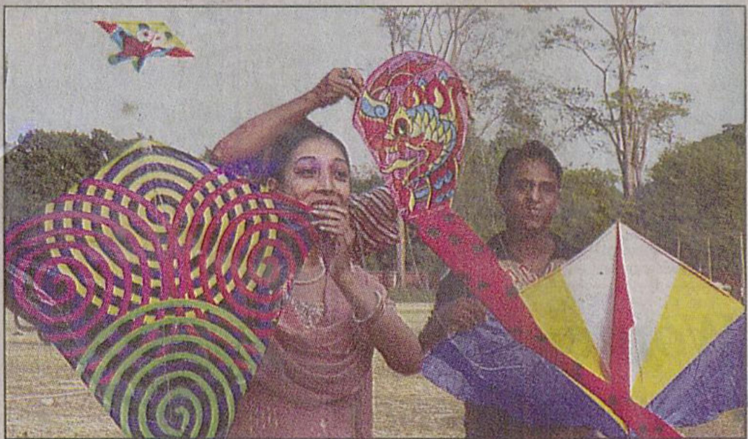
Dhakabasi, an organisation of the residents of Old Dhaka, arranged a kite festival on Dhaka University ground yesterday to celebrate the Independence Day.