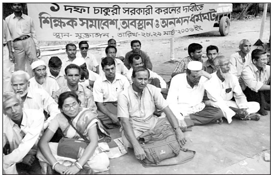
Bangladesh Non-government Primary School Teachers' Association observes hunger strike at Mukhtangan in the city yesterday demanding nationalisation of their jobs.

Khaleda invited Sri Lankan President Mahinda Rajapakse and Prime Minister Ratnasiri Wickramanayake through the High Commissioner to visit Bangladesh.