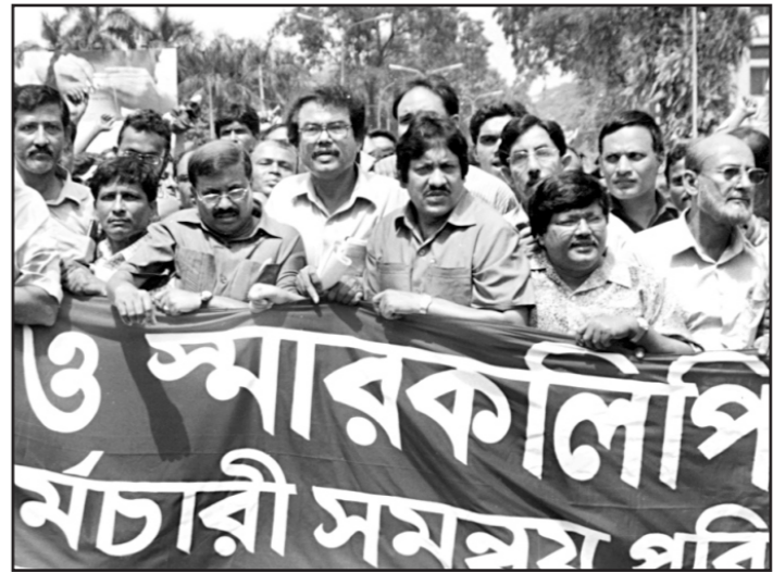
Fourth class government employees stage a demonstration in the city yesterday to press for their demands.