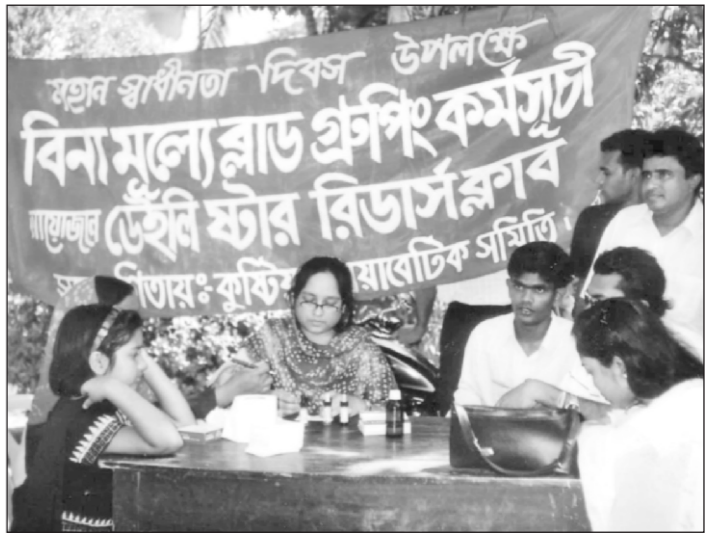
The Daily Star Readers Club holding free blood grouping programme in Kushtia town on Sunday.

Around 200 people including labourers, school and college students and freedom fighters were tested for blood grouping.