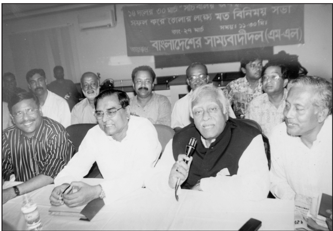
Awami League General Secretary Abdul Jalil exchanges views with journalists at a meeting at Dhaka Reporters' Unity auditorium in the city yesterday. On his right are Workers' Party President Rashed Khan Menon and Awami League leader Obaidul Kader.