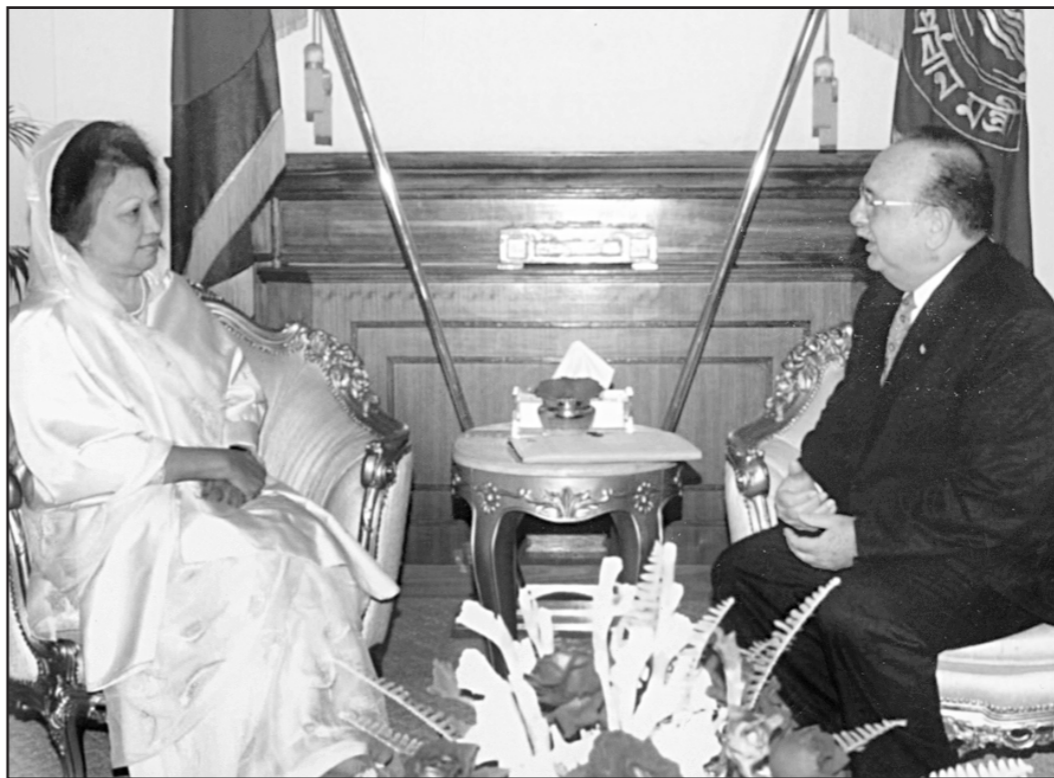
Delhi-based Cuban Ambassador Juan Carretero Ibanez, concurrently accredited to Bangladesh, called on Prime Minister Khaleda Zia at her office yesterday.

He said installation of waste treatment plants in the industrial areas and emission-control device in vehicular transports can help check air pollution.