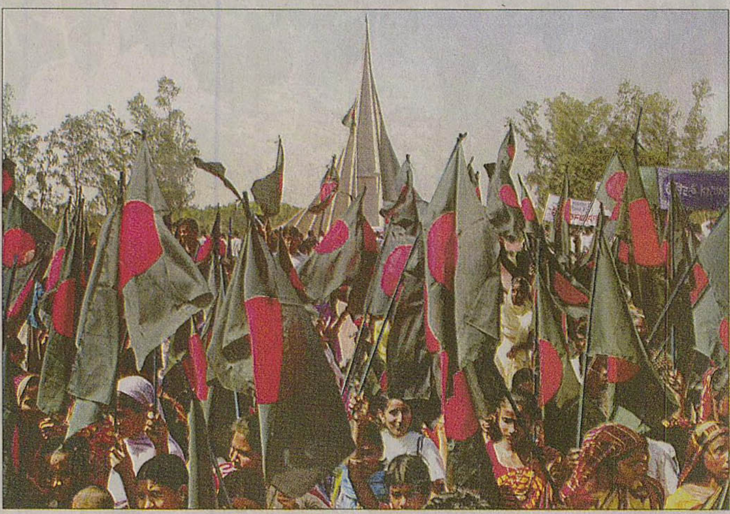
With national flag in hand, thousands of people throng the National Memorial in Savar on Independence Day yesterday to pay homage to the martyrs of the Liberation War.

STAFF CORRESPONDENT The display of achievements and works of different ministries was the centrepiece of this year's Independence Day parade yesterday. Trucks decorated with colourful and large posters depicting 'successes' of the BNP-led coalition government, now in the last year of its term, drove slowly past hundreds of invited guests at the National Parade Square. Rapid Action Battalion's (Rab) operations against militant chief Abdur Rahman and his second-in-command Bangla Bhai were dramatised on stages set up on the trucks. Organised by Nine Infantry Division, the parade was broadcast live by state-run Bangladesh Television. The recorded voice of late president Ziaur Rahman proclaiming independence was played but only partly. "On behalf of Bangabandhu Sheikh Mujibur Rahman", the words that were in the original proclamation, were cut out. A special publication titled 'Great Independence and National Day Parade 2006' was brought out on the occasion. The photographs of Ziaur Rahman, freedom fighters, national monument and Shaheed Minar were printed on its cover. SEE PAGE 15 COL 5