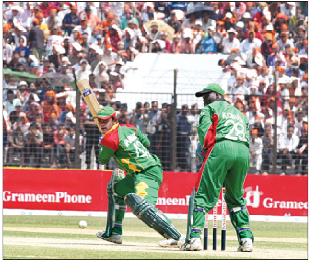
Bangladesh opener Shahriar Nafees guides one down to third man during his knock of 57 against Kenya on Thursday.