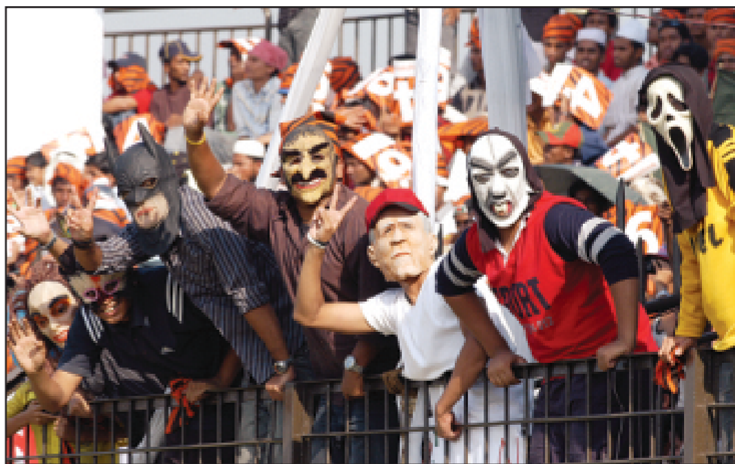
A section of the Fatullah crowd dressed up in colourful masks add a festive touch to the atmosphere during the first international match at the venue on Thursday.

It is likely that FICA will now consult its members before deciding on its next course of action.