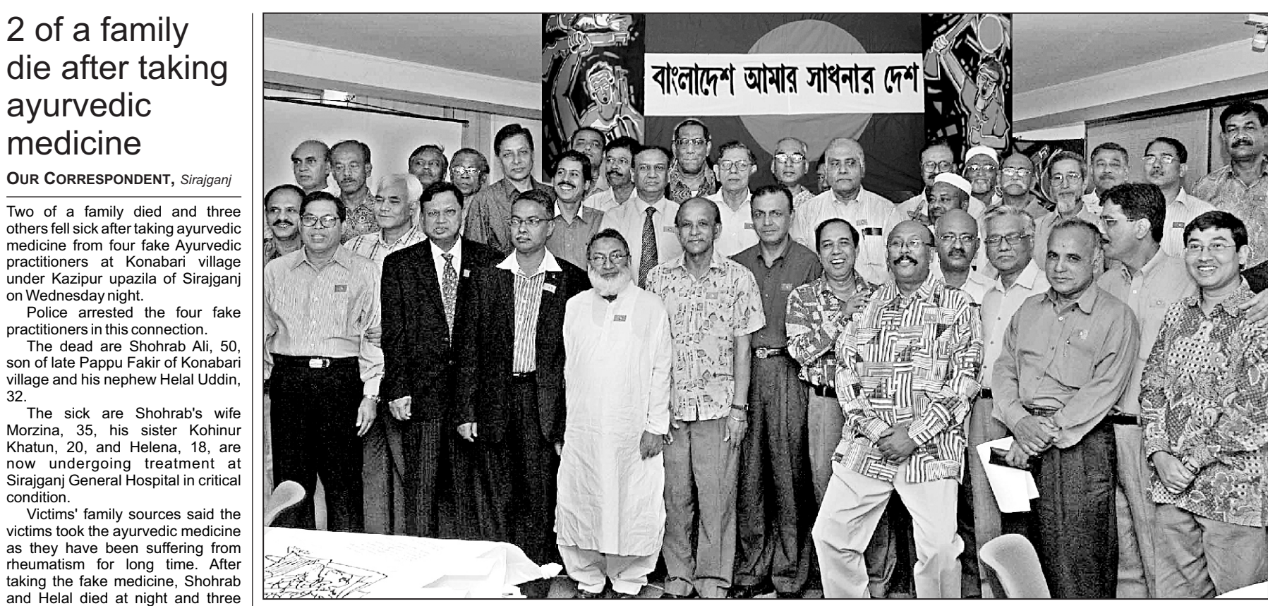
Freedom fighters pose for photograph at a reunion at the Brac Inn Centre at Gulshan in the city yesterday. The FFs organised the social gathering under the banner of 'Bangladesh Amar Sadhonar Desh' on the occasion of the Independence Day.

He asked them to work for the person nominated by the party for