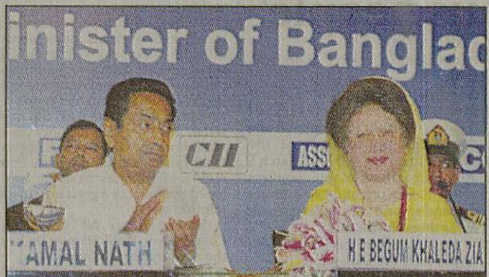
Prime Minister Khaleda Zia and Indian Minister for Commerce and Industry Kamal Nath at the luncheon meeting jointly organised by three leading Indian trade bodies at Hotel Taj Mahal in New Delhi yesterday.

The current visit of the Bangladesh PM has provided both countries with "the opportunity to continue and sustain their high-level political dialogue", said an eight-point joint press release