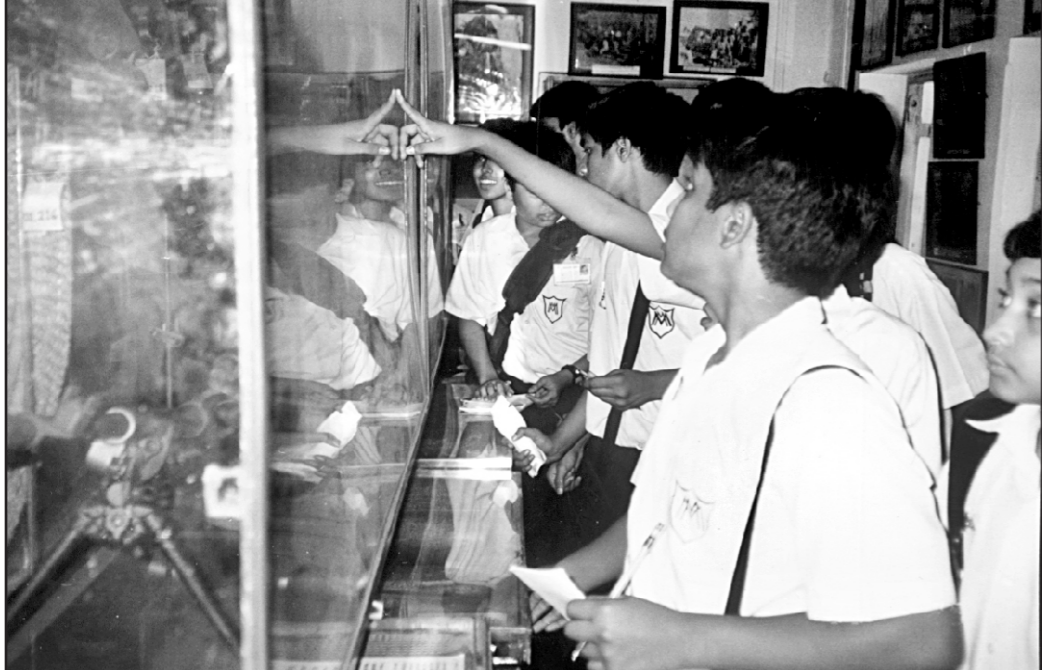
Students at Mastermind School in the city look at mementoes of the War of Liberation on a mobile museum, a project of the Liberation War Museum.

To mark the 10th anniversary, the museum has taken up a week-long programme, including discussions and cultural programmes, to be held on its premises. Renowned educationists will take part in the discussions and different cultural groups will also perform.