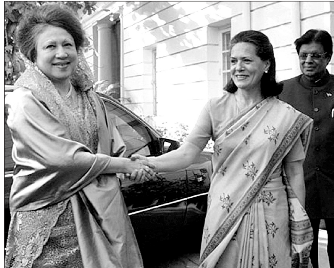
Chairperson of India's United Progressive Alliance and Congress Party President Sonia Gandhi, right, shakes hands with Prime Minister Khaleda Zia at Gandhi's residence in New Delhi yesterday. Khaleda Zia is in India on a three-day official visit.

The 43-member committee consists of eight co-chairmen and seven additional secretary generals along with other regular office bearers.