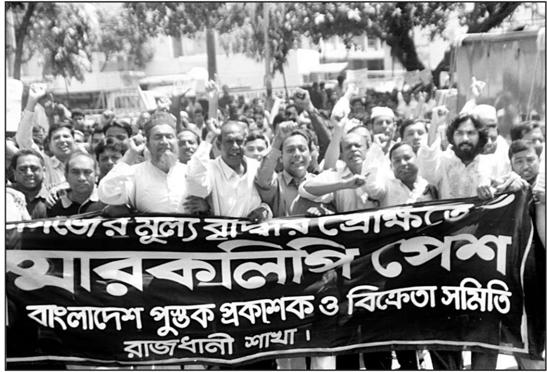
Bangladesh Book Publishers and Sellers' Association stages a demonstration at Bangla Bazar in the city yesterday protesting price hike of paper.

A token hunger strike was observed in the city yesterday protesting the repression on female students of Eden University College by Jatityabadi Chhatra Dal (JCD) cadres. Several hundred women leaders and activists of opposition parties along with current and former students of the college took part in the programme from 11:00am to 1:30pm at Muktangon.