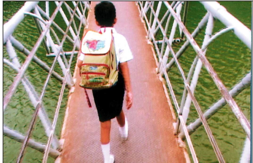
A scene from Ashchhey