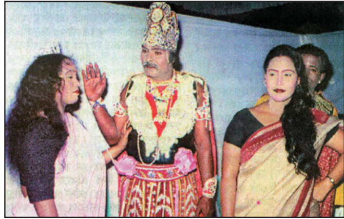
Actors performing in the jatra Bedkonya

The festival will wrap up on March 23. Desh Opera will stage Karnolar Banobash , written by Karim Khan.