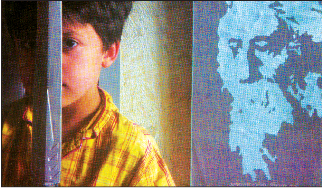
War & Peace (Top) and Invitation