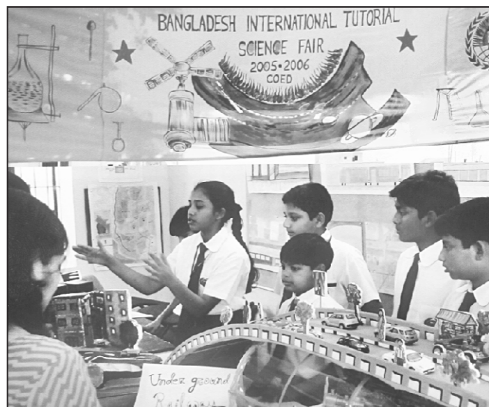
Students of Bangladesh International Tutorial explain their project at the Annual Science Fair held on March 17-18 on its campus in the city.

Bangkok Hospital expanded Staff Correspondent