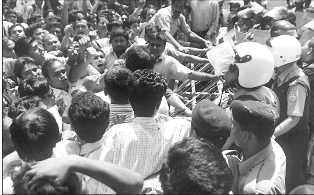
Police intercept the activists of Chhatra Sangram Parishad at Palashy intersection in the city yesterday as the demonstrators were marching towards Eden College to lay siege in protest against the attacks on general students by Jatiyatabadi Chhatra Dal activists.

Awami League leaders Motia Chowdhury, Saber Hossain Chowdhury and Mofazzal Hossain Chowdhury Maya went to the spot yesterday.