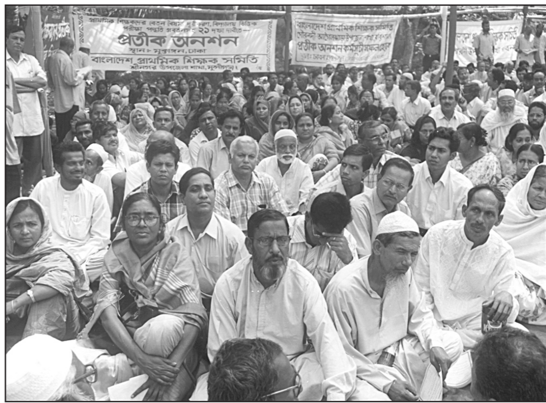
Bangladesh Primary Teachers' Association stages a token hunger strike at Mukhtangan in the city yesterday to press their 21-point demand, including an end to discrimination in salaries.

BFUJ meeting. A joint meeting of the newly elected and outgoing executive committees of Bangladesh Federal Union of Journalists (BFUJ) will be held.