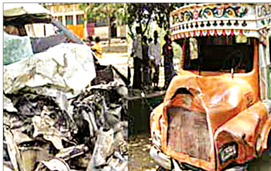
Crushed microbus and truck after they collided head-on at Hijaltali under Kaliakoir upazila of Gazipur district on the Dhaka-Tangail highway yesterday. The accident killed seven people and injured four others.

The United States has not indicated it is willing to offer the same treatment to Pakistan,