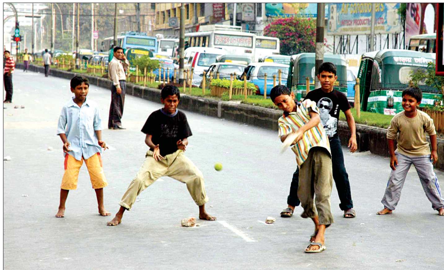
Children play cricket on the VIP road adjacent to the Bangla Motor crossing yesterday, as the road was made off limits to vehicles for Titas Gas pipeline installation.