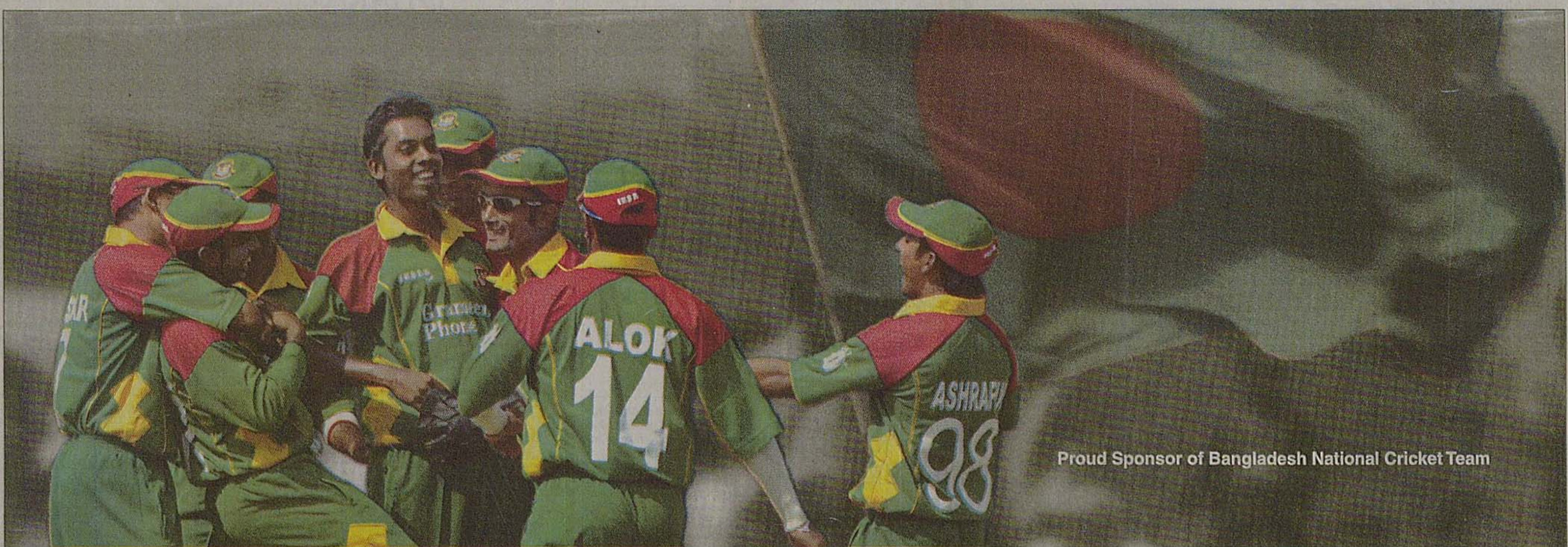
Proud Sponsor of Bangladesh National Cricket Team