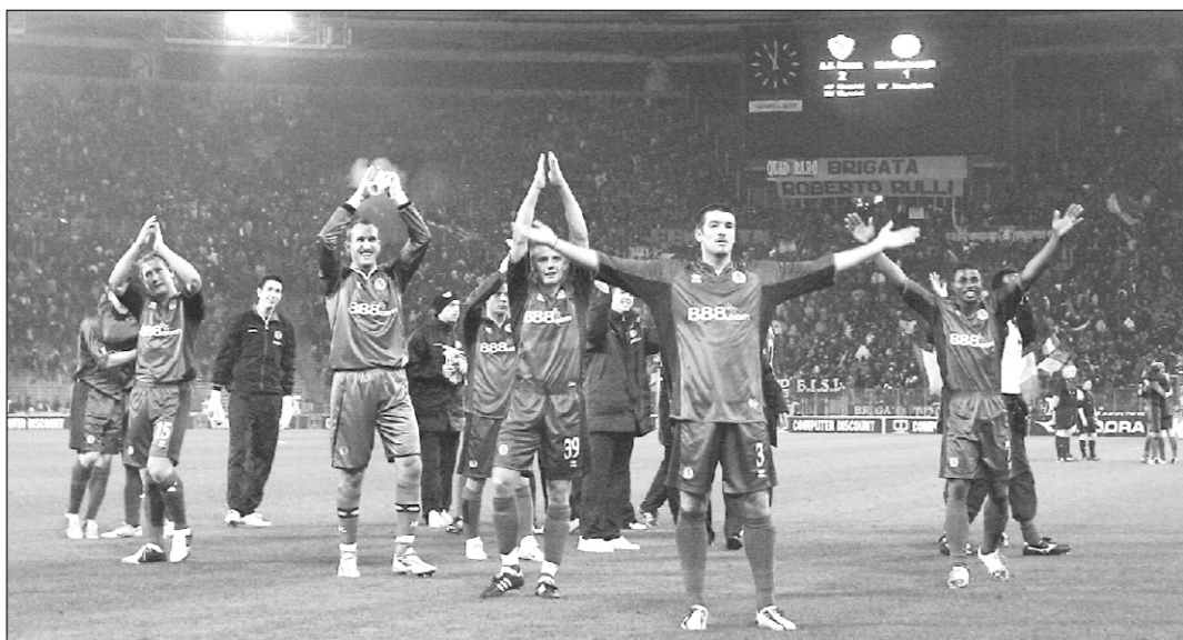
Middlesbrough players celebrate their progress into the last eight at the end of their UEFA Cup match against AS Roma at the Stadio Olimpico on Wednesday.

R Ponting, J Langer, M Hayden, D Martyn, M Hussey, A Gilchrist, A Symonds, S Warne, B Lee, M Kasprovicz, S Clark. Umpires: Aleem Dar and B Doctrove.