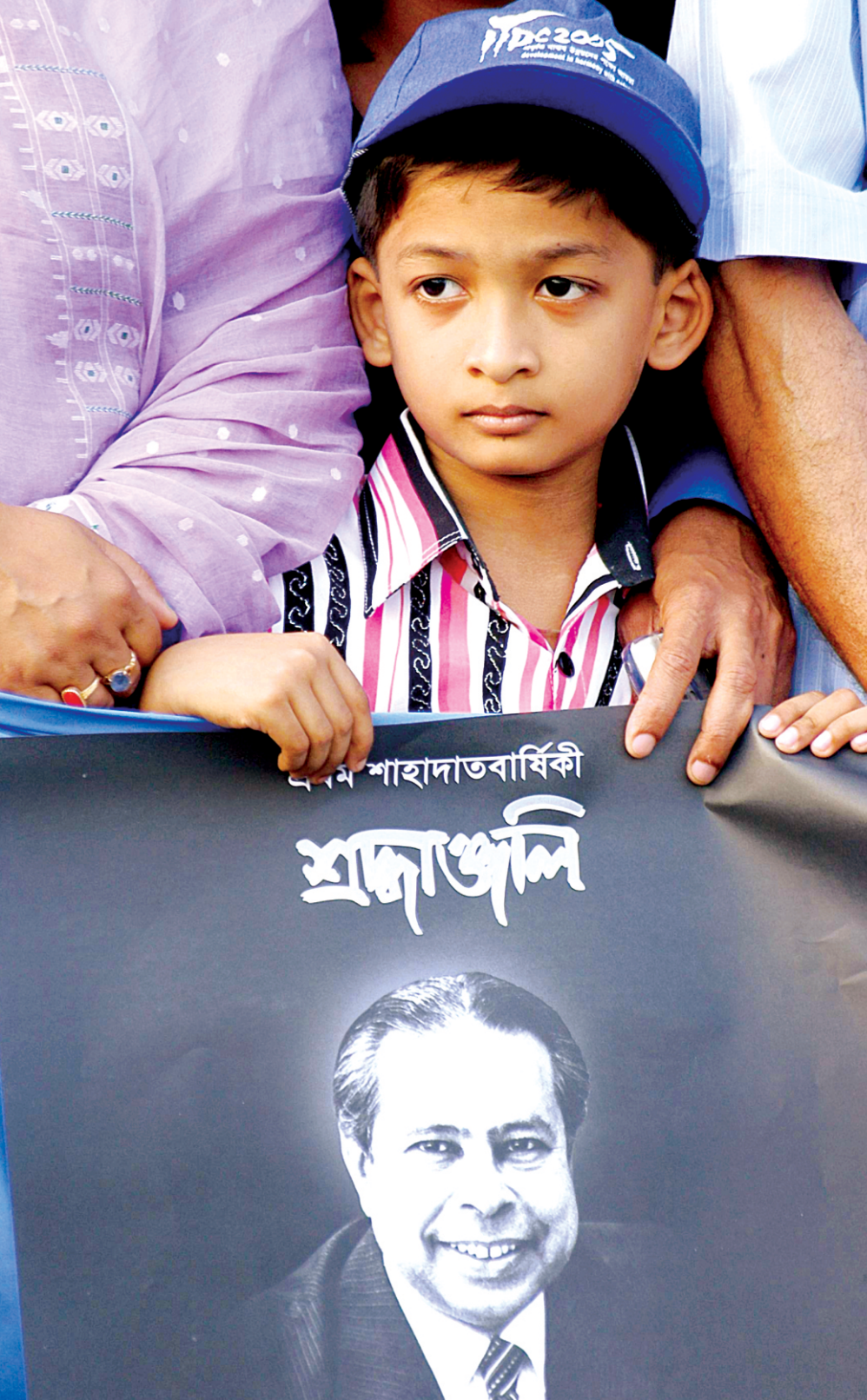
A boy holds a poster with the portrait of slain former finance minister Shah AMS Kibria during the 'Blue for Peace'

after Juma prayers today at the new DOHS mosque at Mahakhali in the