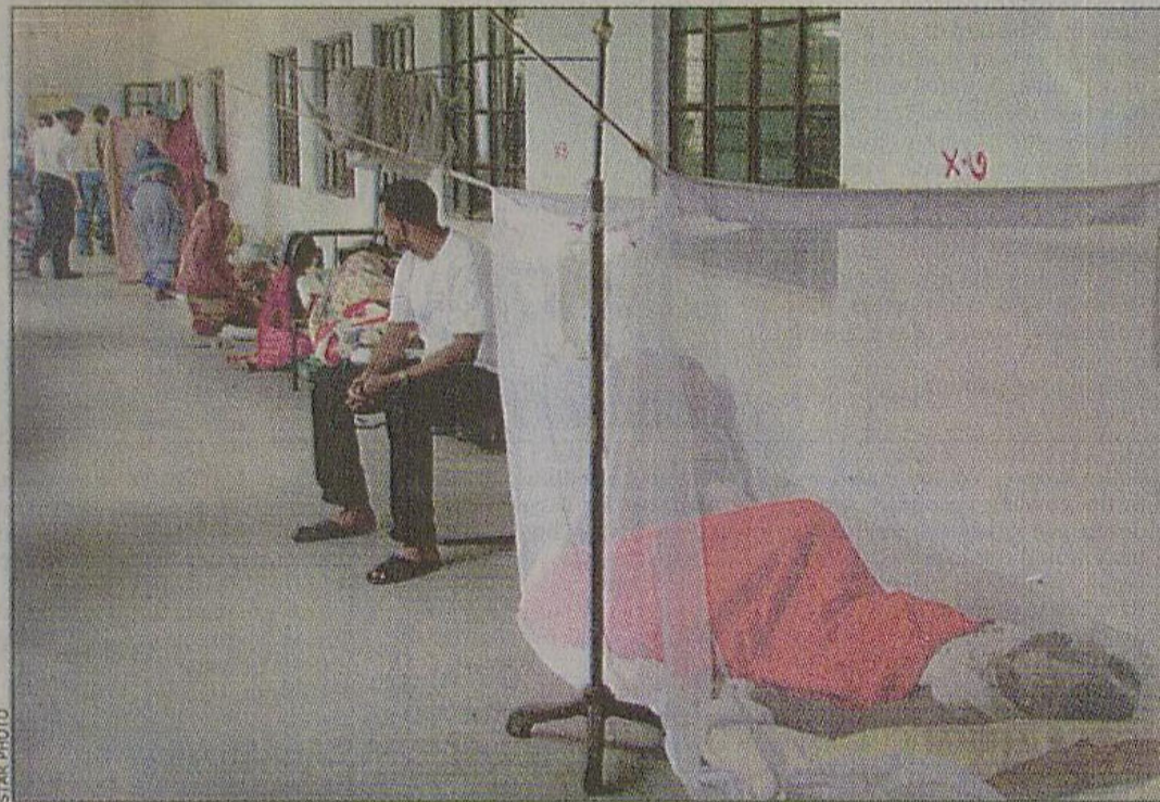
Burnt patients are under treatment on the floor of Chittagong Medical College Hospital.

Fate of project for separate burn unit uncertain