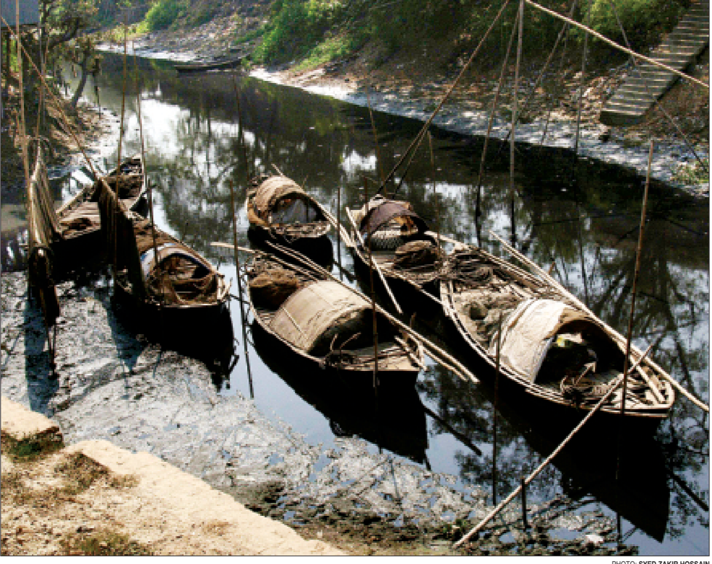
The cannal carries toxic chemical wastes dumped by dyeing factories to the Shitalakha river. The photo was taken from Mokhtarpur.

Alleges Jalil STAFF CORRESPONDENT Awami League (AL) General Secretary and 14-party opposition combine Coordinator Abdul Jalil yesterday alleged that the prime minister is conspiring to use the armed forces in the upcoming election. "The prime minister in her speech at a rally said the army would be under president's control although we proposed to keep it under the chief of caretaker SEE PAGE 15 COL 4