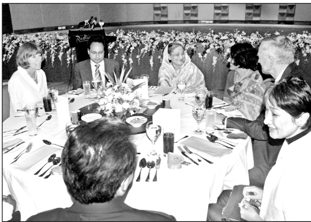
Leader of the Opposition in Parliament and Awami League President Sheikh Hasina, third from left, talks with foreign diplomats at a dinner hosted by her party at a city hotel yesterday.

roads and railway, the official said these are the matters that might come up during talks between the two prime ministers. However, Dhaka might remain non-committal on extradition-treaty or tri-nation pipeline.