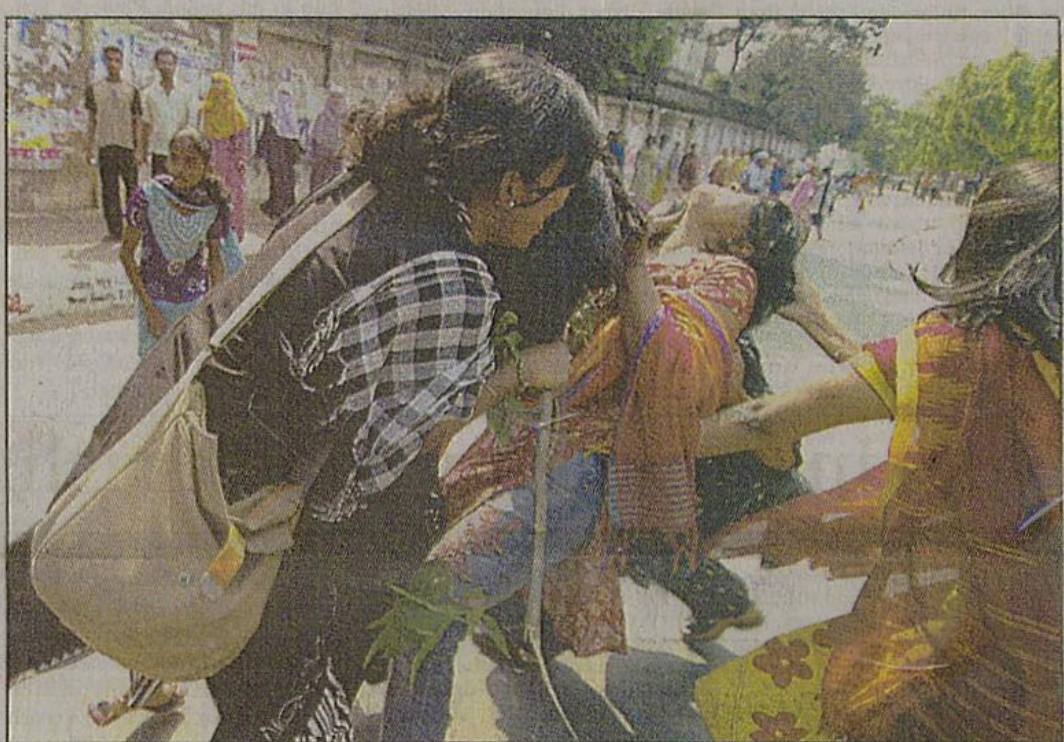
Jatiyatabadi Chhatra Dal cadres maul a student of Eden University College demonstrating in front of the campus against Chhatra Dal's domination. The scuffle in the city yesterday left several students including two Chhatra Dal members injured.