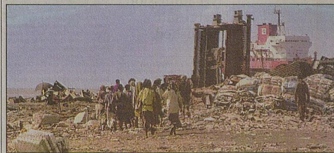
Barefooted workers wearing Lungi and without any safety gears heading for work to a ship-breaking unit in Sitakunda, Chittagong.