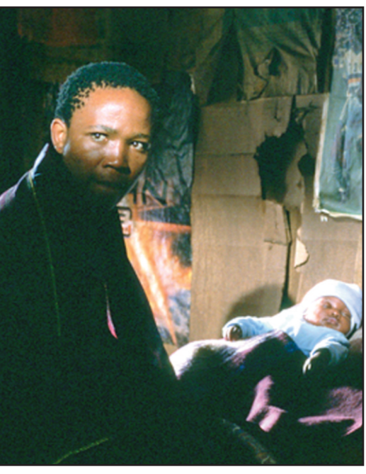
A scene from Tsotsi

The first South African film to win an Oscar, Tsotsi follows six days in the life of the leader of a group of young gangsters. A heist gone wrong leaves the protagonist of the film, holding a three-month-old baby. His decision to nurture the child sets him on a path of possible redemption. The film is an adaptation of the only novel by the South African playwright Atholl Fugard. The novel ended bleakly, with the protagonist literally and metaphorically crushed by the apartheid regime. In a significant shift, the positive tone in Hood's post-apartheid version suggests that, despite appalling problems, South Africa is characterised by a mood of optimism. Mbeki comments that Tsotsi is an appropriate representation of the "Age of Hope" that is the country's current climate. Not surprisingly, Tsotsi has been South Africa's biggest box office success for 15 years. It has also generated strong box office in the US since its release there last month, and imminent release dates in the UK and beyond should see the film programmed in both arthouse cinemas and multiplexes. Apart from well-defined, sympathetic characters, strong central performances and sharp cinematography, the director knew how to tell a strong story, in terms of both narrative development and visual style.