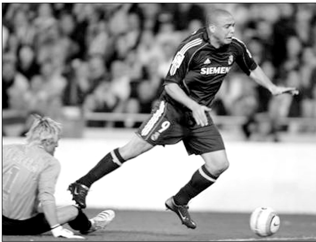
Real Madrid striker Ronaldo (R) being tripped inside the penalty box by Valencia goalkeeper Santiago Caizares during their Primera Liga clash at Mestalla Stadium in Valencia on Saturday.