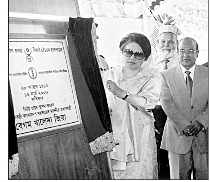
Prime Minister Khaleda Zia lays foundation stone of Bangladesh Institute of Health Science Hospital at Darussalam at Mirpurin the city yesterday.

is to empower people to take care of their own health. HCDP envisages forming a countrywide network of general care delivery by using and expanding the DAB facilities and the Ibrahim model