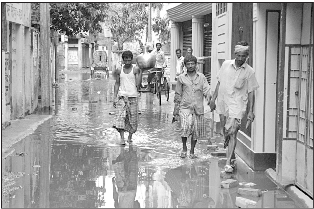
Sewerage water remains stagnant for months on a road at East Rampura in the city due to lack of proper drainage system, but the authorities have turned a blind eye to the suffering of the local residents and passers-by.