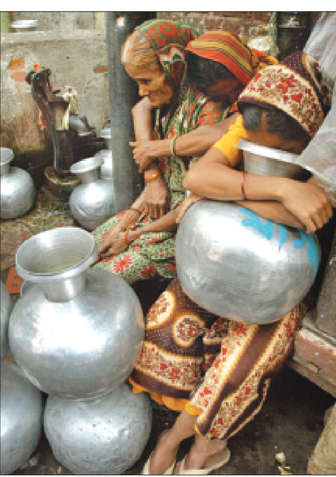
Waiting for hours to fetch water from Wasa supply line, two women drowse while another gives a blank look at Shankhari Bazar in the capital.