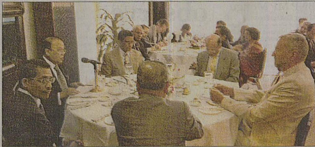
Foreign Minister M Morshed Khan, second from left, brief diplomats, at the state guesthouse Padma, on the progress of investigation following the arrest of militant kingpins.