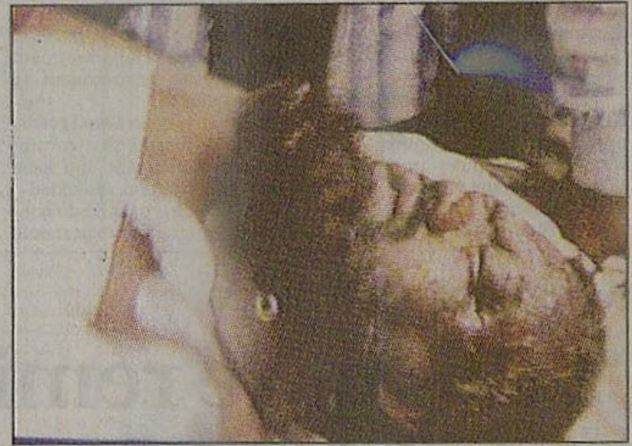
Bangla Bhai at the Mymensingh Medical College Hospital after undergoing a minor surgery there.